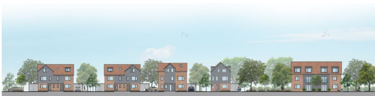
Fig.2 – Proposed Street Scene